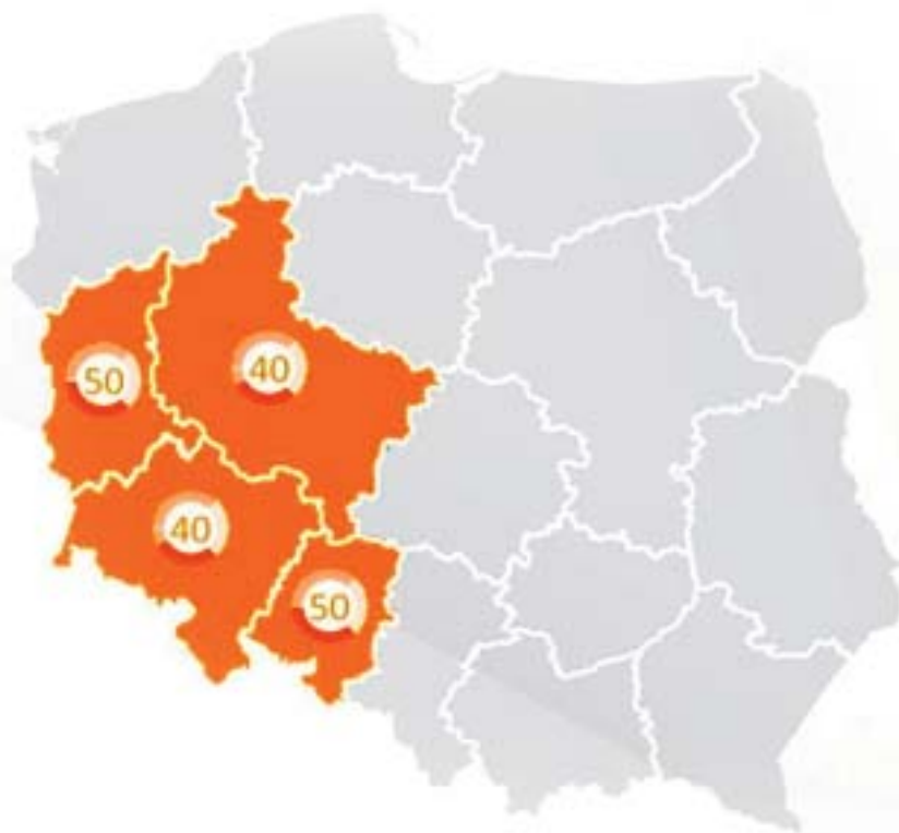
Map of regional aid in WSEZ in years 2007–2013

BIG-SIZED Entreprise: 40% MEDIUM-SIZED Entreprise: + 10% SMALL-SIZED Entreprise: + 20%